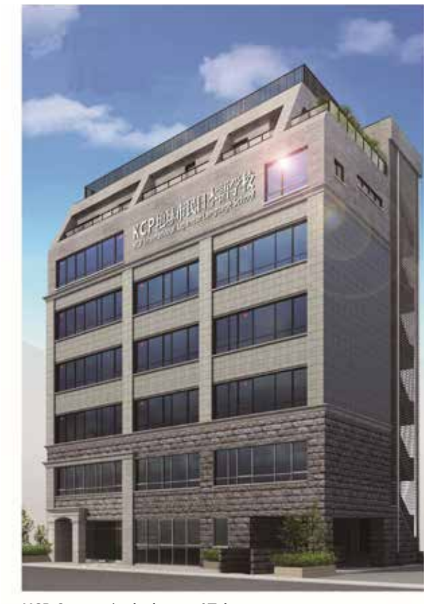
KCP Campus in the heart of Tokyo