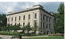
Indiana State University