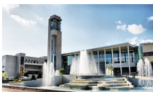
Missouri State University