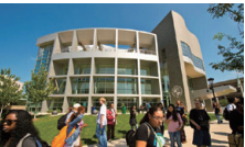
Cleveland State University

These universities grant academic credit to students who are enrolled at them.