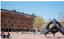
Western Washington University

These universities grant academic credit to students enrolled at them and can also grant transfer academic credit to students from other colleges who apply to the KCP program through them.