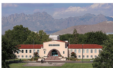
New Mexico State University