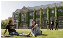
University of Idaho