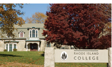
Rhode Island College