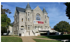
Virginia Union University