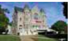
Virginia Union University