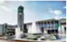
Missouri State University