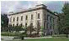
Indiana State University