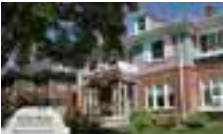
Idaho State University