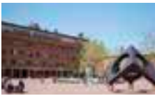
Western Washington University

These universities grant academic credit to students enrolled at them and can also grant transfer academic credit to students from other colleges who apply to the KCP program through them.