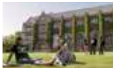
University of Idaho