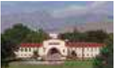
New Mexico State University