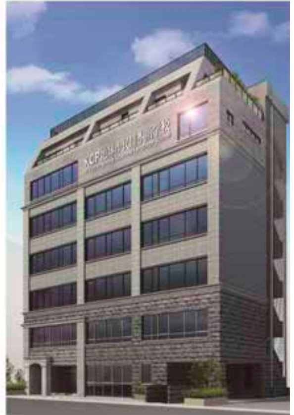
KCP Campus in the heart of Tokyo