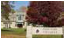
Rhode Island College